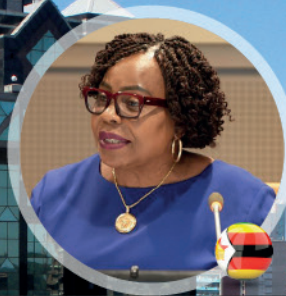
Hon Sen Monica Mutsvangwa Ministry of Women Affairs, Community, Small and Medium Enterprises Development of Commerce & Industry